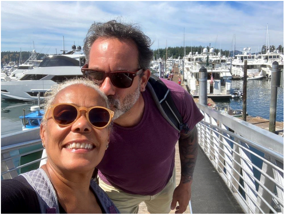
The love of my life, Roche Harbor, WA 2021