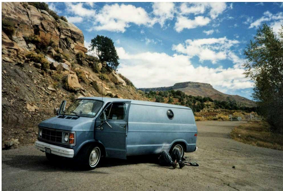
Fixing a problem somewhere in the Southwest, 1993