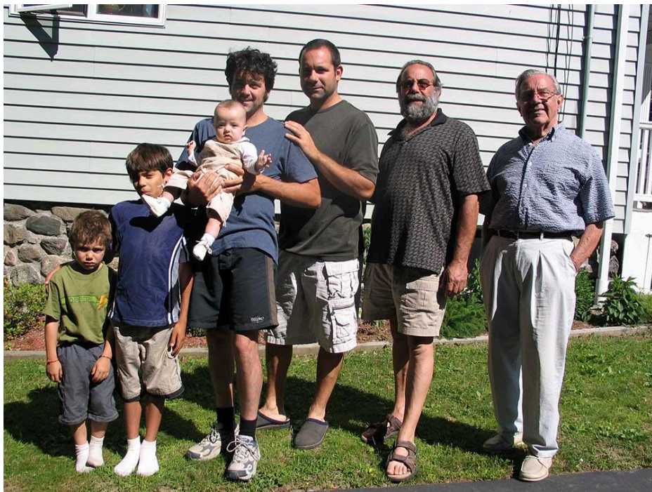
Generations of Croce Men, Belmont, 2004