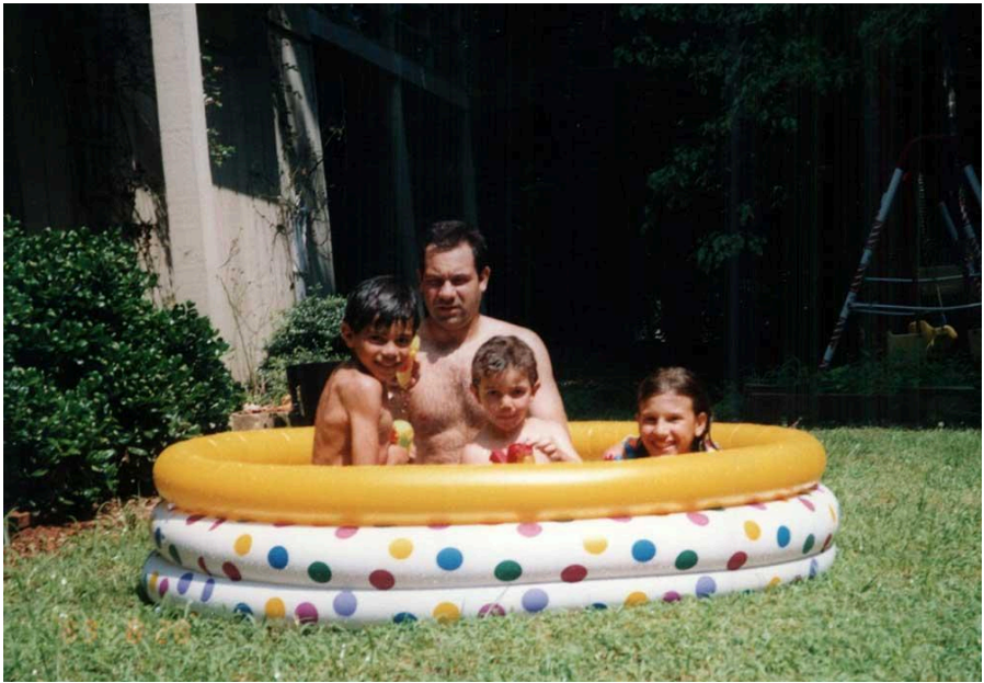
The strangest picture of me ever taken