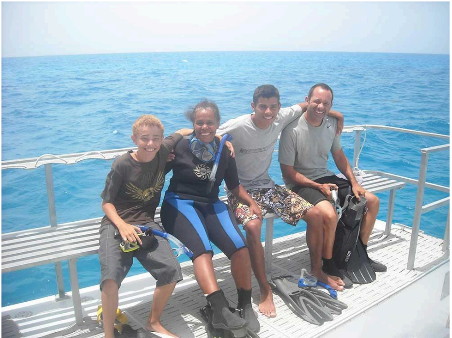
Shark bait. Long Island Bahamas, 2012